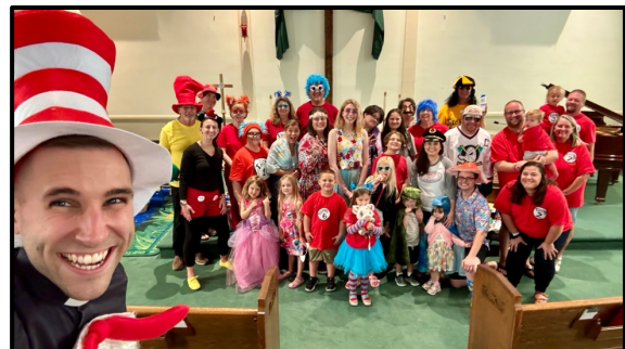
Picture 9 The Great Seusscharist - 8/18/24

Even with all of this worth celebrating, what continues to bring me the most delight in serving with you in this community is that, as a community, you continue to bring the fullness of who you are – your excitement, your flair, your joy – to all that we do together! From the fun of our church picnic to the goofiness of Doctor Seusscharists and pajama Sundays, you continue to remind me that you are a community who leads by joy.