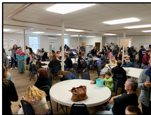
Picture 4 UIC Egg Hunt - 3/30/24

This past year was also largely characterized by taking ministries and events that we had had run in the past and building on their success. The greatest examples of this were perhaps found in this past year's Egg Hunt that was the most well attended it's ever been! The walls (and yard) were PACKED with kids and eggs coming from every possible direction! Likewise, this year was our largest Trunk-or-Treat event out of the three years we've been hosting it with MLC and CELC! The icing on the cake this year