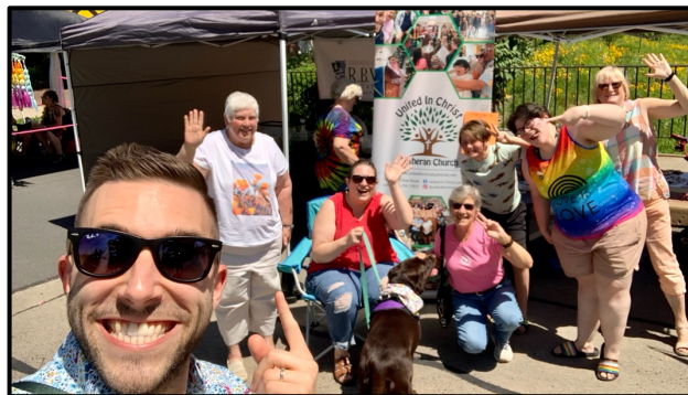
Picture 2 UIC at Lewisburg Pride 6/1/24

We also continued to deepen our relationships with the neighbors in our community. We continued to serve our neighbors through the distribution of the ElderShare food boxes, through our participation in Milton Panther Pack Program, and through our support of the residents at Danville State Hospital and the veterans at Orangeville Manor. Those open doors even allowed for UIC folks to venture out to Orangeville Manor and host a day of bingo and a free meal for folks there! Just as excitingly, we saw our witness and relationship with the community grow as we participated in the Lewisburg Pride event for the second year in a row. Our presence at that event provided a powerful witness that deepened our commitments to the neighbors around us as being rooted in the love of God!