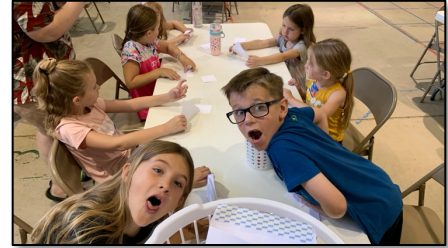
Picture 5 Faces from Day Camp - 7/10/24

On a highly pragmatic level, this built-on success certainly played out to our benefit with our Summer Day Camp this year. Partnering once again with MLC, CELC, and Camp Mount Luther, this year's day camp experience was perhaps the smoothest yet for our volunteers and participants! With the pavilion at West Milton Park having been torn down, this past year we got to embrace another partnership with Faith Lutheran as they opened their doors for us to host day camp from their building (which ended up working perfectly for as much as it rained)!