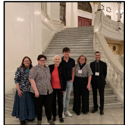
Picture 8 UIC at Lutheran Day at the Capitol - 5/9/24

Second, I continue to serve on the Policy Council of Lutheran Advocacy Ministry in Pennsylvania (LAMPa). LAMPa serves as the expression of the Church called to bear faithful witness to our convictions and the care of our neighbor at the state level of government. Each year, LAMPa sets a policy agenda that shapes the voice of such advocacy and places that voice at the tables where decisions affecting Pennsylvanians across the state are made. Importantly, LAMPa's work in continuing to advocate for budget prioritization for feeding programs, including funds for the Central Pennsylvania Food Bank, is what allows programs like our ElderShare Food Boxes to continue functioning in our communities. I'm grateful for the opportunity to be a part of this work. I'd also invite you to see that work first hand at the 2025 Lutheran Day at the Capitol on Tuesday, May 13 th ! Save the date and let me know if you'd like to join me for that time together provided by LAMPa!