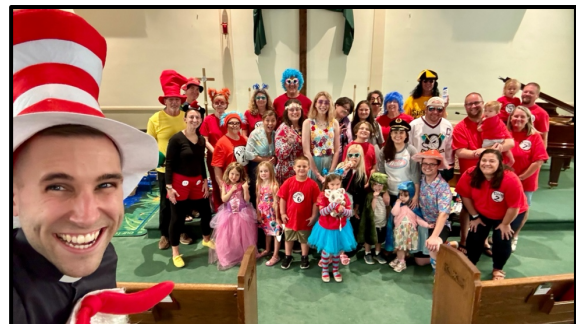
Picture 9 The Great Seusscharist - 8/18/24

Even with all of this worth celebrating, what continues to bring me the most delight in serving with you in this community is that, as a community, you continue to bring the fullness of who you are – your excitement, your flair, your joy – to all that we do together! From the fun of our church picnic to the goofiness of Doctor Seusscharists and pajama Sundays, you continue to remind me that you are a community who leads by joy.