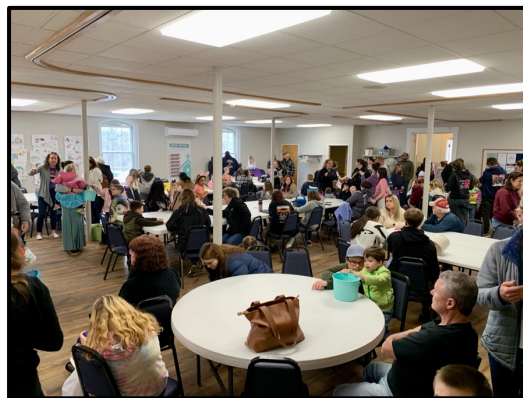
Picture 4 UIC Egg Hunt - 3/30/24

This past year was also largely characterized by taking ministries and events that we had had run in the past and building on their success. The greatest examples of this were perhaps found in this past year's Egg Hunt that was the most well attended it's ever been! The walls (and yard) were PACKED with kids and eggs coming from every possible direction! Likewise, this year was our largest Trunk-or-Treat event out of the three years we've been hosting it with MLC and CELC! The icing on the cake this year