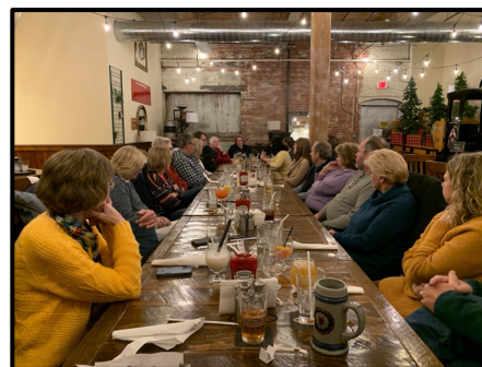
Picture 3 Theology on Tap

One of the most unexpected places of our deepening relationships, however, took root this year through our Theology on Tap program. This group continues to meet on a bi-weekly basis with about twenty people at each outing. This past year, in addition to the regulars from UIC and CELC, we've been welcoming neighbors from Messiah Lutheran in New Berlin while they are in pastoral interim. It has been a true joy getting to know these Lutherans on the other end of the county, but it was even more exciting to have them join us in worship this past summer for Christmas in July!