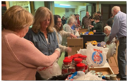
UIC packing Milton Panther Packs on Wednesday, March 6.