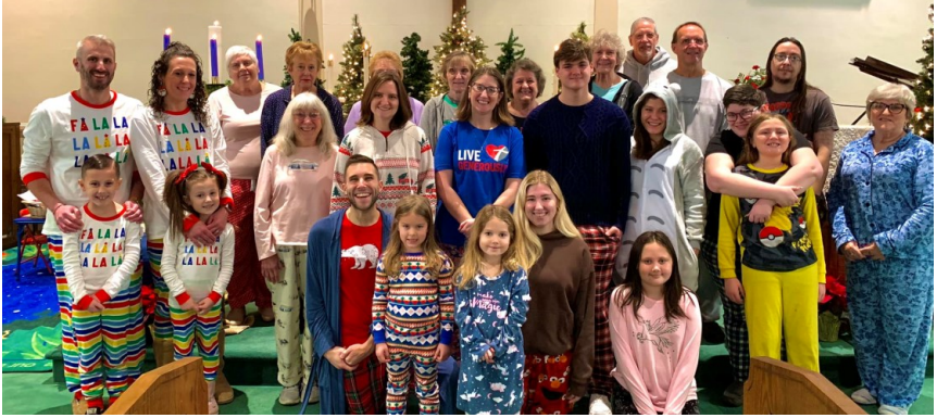
Lessons and Carols Sunday, aka Pajama Sunday!