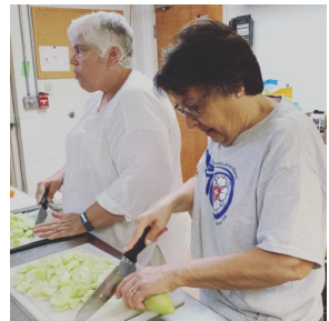
UIC and CELC volunteering at the August 14th meal.