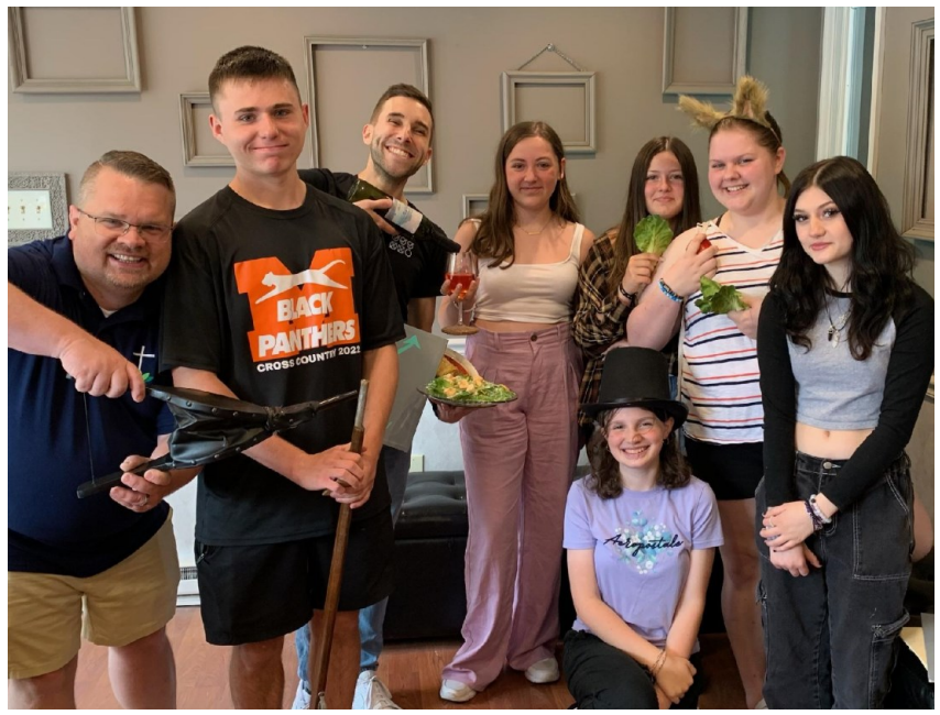
Youth Group at Bloomsburg's CAN U XCAPE escape room.