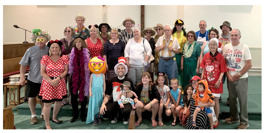
** 2019 **

So grab the whole family! Invite all your friends! Our 10 o'clock service, you'll want to attend! For May 21<sup>st</sup> ain't a day to be missed: You'll want to be here for The Great Seusscharist!