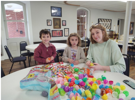
Filling eggs on Good Friday for the egg hunt.

Sherry Bingaman applied for a Thrivent Action Team and her application was accepted! UIC received a $250 gift card which was used to purchase prizes for the egg hunt.