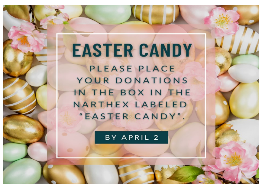
Filling Eggs: Friday, April 7 @ 9am

We will be filling the eggs on Friday, April 7 at 9am in the Fellowship Hall. Everyone is invited to come help!