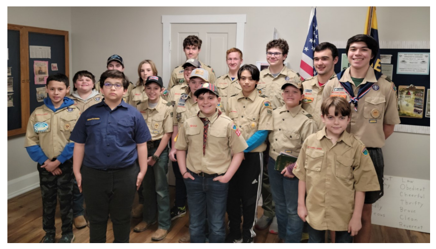
Boy Scout troop #600 had another successful Spaghetti Dinner. They sold over 300 meals and 197 jars of sauce!!