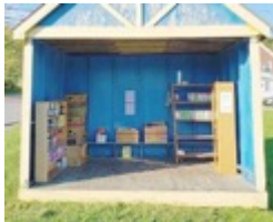
Our Little Free Pantry in West Milton

MONTHLY FOOD COLLECTION: Social Ministry collects non-perishable food items each week.