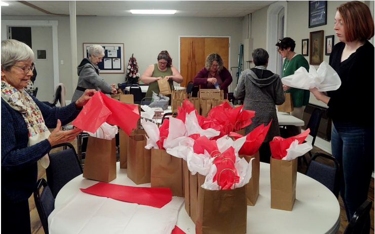
Putting together Blessing Bags

50 Blessing Bags, which contained shampoo, body wash, lotion, deodorant, and candy, were put together and given to everyone at Country Comfort and also to each of our Senior Express Food Program at UIC.