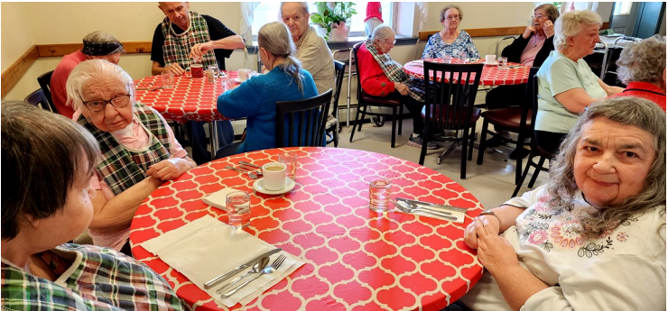
Residents at Country Comfort