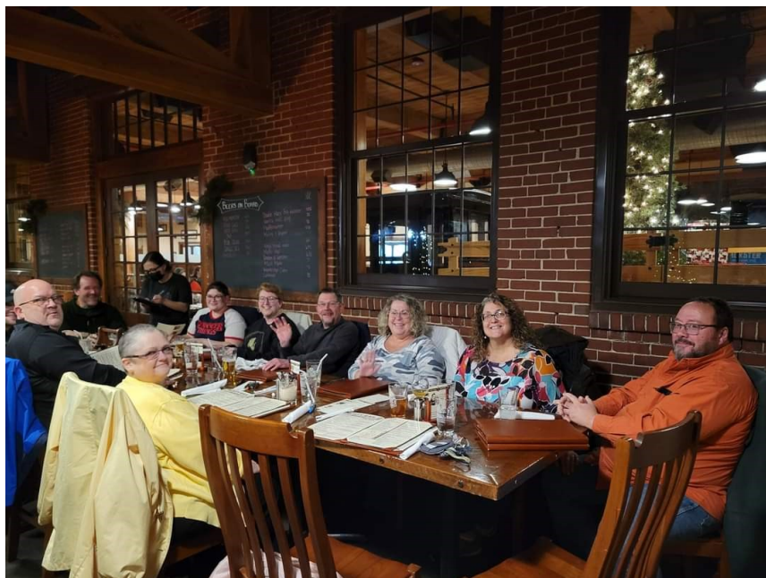
December 6th, Theology on Tap Rusty Rail Brewery, Mifflinburg PA