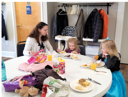
Thank you to everyone that came out for Easter Breakfast!