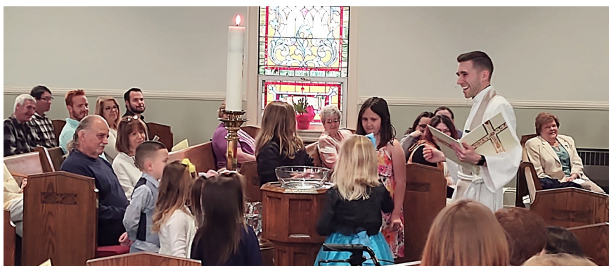
In the waters of baptism, we have passed over from death to life with Jesus Christ, and we are a new creation!