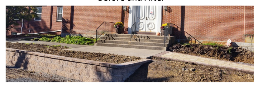
Two things need to be done yet, landscaping and installing our new sign. Thank you to everyone that made this possible!!