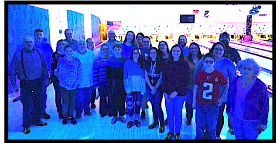
UIC at Imperial Lanes for Rock & Bowl – 3/8/19

But even beyond worship, this year you also demonstrated your earnest appreciation for one another by taking the time to gather as community in new spaces beyond the church. In March, over thirty people from UIC gathered together to simply go bowling as a group over in Milton! Later in August, over sixty of us got together at R.B. Winter State Park, just for the sake of enjoying one another's company surrounded by the joy and fun of God's creation! Last Fall, we even braved the chilly changing seasons to get together and tackle the Corn Maze at Ard's Farm! Over and over, you demonstrated the strength of God's Spirit moving among God's people. As a community gathered together in these visible spaces, you shined a light of what joy-filled unity can be for our world and in our time!