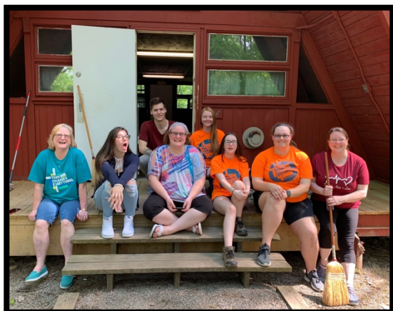
UIC youth and chaperones help clean out UIC's sponsored cabin at Camp Mount Luther before campers arrive for the summer – 5/19/19

Yet, for all of these ways of being community, what continues to impress me more and more here at UIC are the ways in which you continue to use those communities for the sake of building God's kingdom and reaching out to our neighbors in wonderful and life-giving ways. I