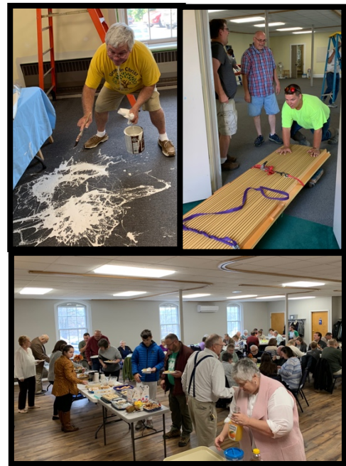
A brief snapshot of the blood, sweat, tears and laughter that went into renovating our Fellowship Hall.

At the same time, the deep intrinsic work of these studies was matched with an equal dedication to the future of our physical space this past year. Following the challenge we set at the November Congregational Meeting of 2018, this year you came through and completed a $15,000 project to renovate our Fellowship Hall. The dedication and effort you exhibited throughout this process was nothing less than astounding and spoke volumes about the ways in which you are committed to the future of this place. Through the offering of your time, talents, and financial resources, you managed to strip the room of outdated infrastructure, paint a fresh look into the space, and bring in a new floor that will sustainably last long into the years ahead. As a result, you have created a magnificent space for building and strengthening genuine community here at UIC! It's a space that now authentically reflects the innate giftedness of this congregation to come together in joy to become a community united in Christ.