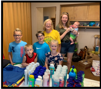
Students help package up comfort bags donated to Children and Youth for our neighbors in difficult times during – 7/8/19

Undoubtedly, 2019 was a full display of your values of mission and service grounded in God’s love here at UIC. Yet, just as exciting as seeing these long-held values take on fresh forms