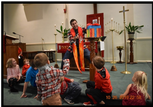
Faith and Fun Worship in action on Reformation Sunday – 10/26/19

But it turns out that the joy of Faith and Fun could not be contained to just one summer! Seizing on the momentum of these days, last Fall we piloted a new “Faith and Fun Worship” service! This service was designed to bring elements of our traditional Sunday School faith