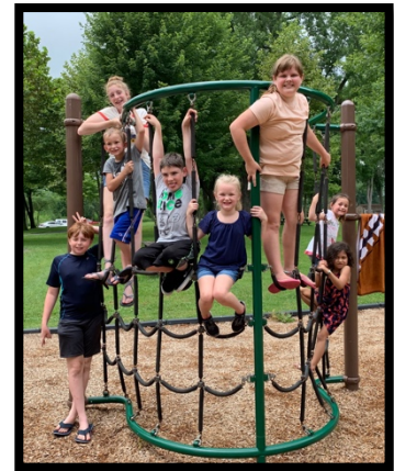
Faith and Fun Day students monkeying around at Milton State Park – 7/22/19

is the way that you have pioneered new avenues of community this past year. Nowhere has this been on better display than in your whole-hearted embrace of our new “Faith and Fun” programming for our students. It all started last summer when we introduced our “Faith and Fun Days” series. This was an opportunity for our younger students to gather together over five days across the summer for faith formation through fun, education, music, crafts, and