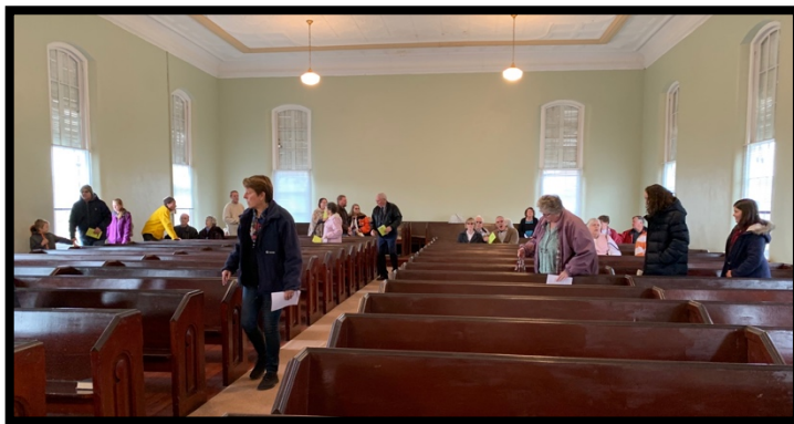
Members gather across the street at St. Peter's UCC as part of our joint service celebrating 200 years of worship on the hill! – 11/17/19

Yet, even with all of that, your sense of community pushed the boundaries to explore new ways of gathering with the neighbors around us. This past year, we even stepped out from our spaces to seek being community in new ways with new neighbors in our area. In November, we gathered to give thanks to God for the communities of faith between the Twin Churches.