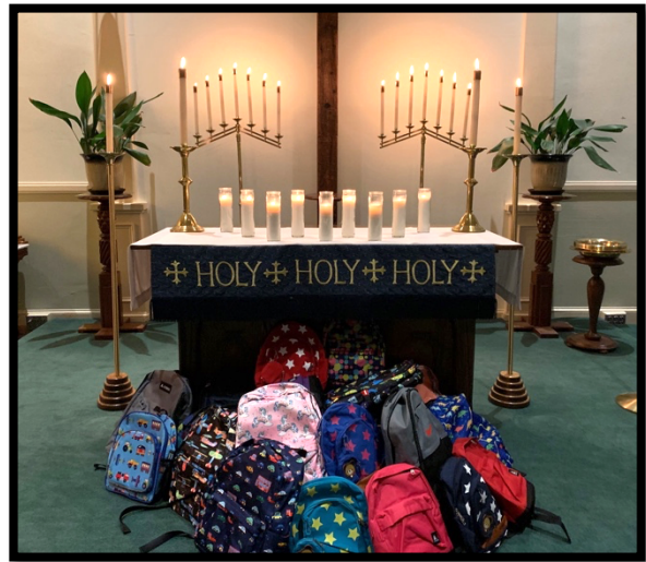
Twenty-seven candles lit in memory of the twenty-seven victims of the shooting at Sandy Hook Elementary with backpacks collected for local area students during the Sandy Hook Vigil – 12/3/19

Not only was it a blessing for us to be welcomed in new places this year, but as we continue seeking to be a community of faith present for the world around us, we also had the opportunity to welcome others into our own space over the course of the year. In August, we hosted the inaugural Buffalo Valley Conference Lay Gathering here at UIC. This gathering was a product of decisions made at June's Synod Assembly and served as the first opportunity for the members of many ELCA congregations in our area to come together and discern new ways of being Church together in our territory. Due to its initial success, this group has continued to meet quarterly and has some great plans in place for joint ministry efforts across our region. Additionally, this past December we had the privilege of hosting a community vigil for the victims of the Sandy Hook School shooting seven years ago. As we gathered together with members of our surrounding community, we engaged in the somber, but sacred work of remembering and honoring the victims of that tragic shooting. By welcoming community members, we shared with them the gifts of comfort and sacredly held grief with which we, as a community of faith, have been equipped.