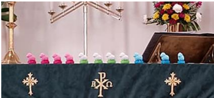
Parable of the lost sheep.

Here are a few pictures from September's Faith and Fun Worship.