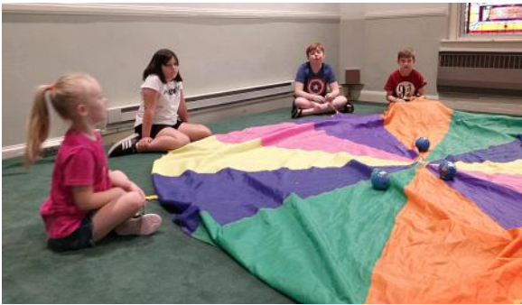
Photos from our first Faith and Fun Day.