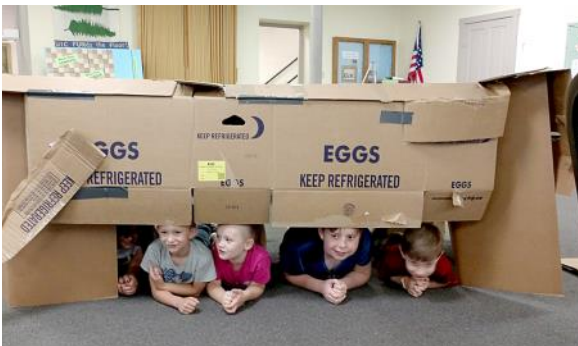
Go to our website and click on "Church News" to see more pictures.