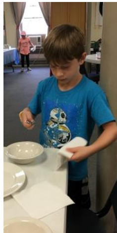
Preparing a meal for our families that evening.

Along the way we had a ton of fun and learned a lot about the gifts of God's love that we get to taste, see, hear, smell, and feel through this meal we share together each and every week!