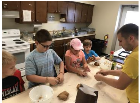
Learning how to bake bread (which we used in worship).