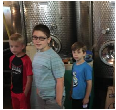
Getting a tour of Shade Mountain Winery (where we get our communion wine).