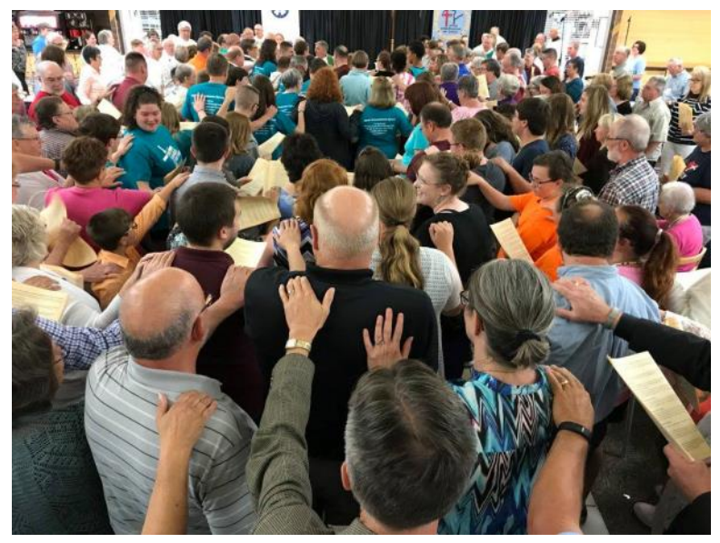
A blessing was offered for the ELCA Youth Gathering participants at the Assembly's closing of worship.

Read the full resolution here: <u>http://www.uss-elca.org/wp</u>-<u>content/uploads/2018/06/Resolution-Regarding-the-</u> Treatment-of-Migrant-Children-in-the-Custody-of-the-<u>United-States.pdf</u>